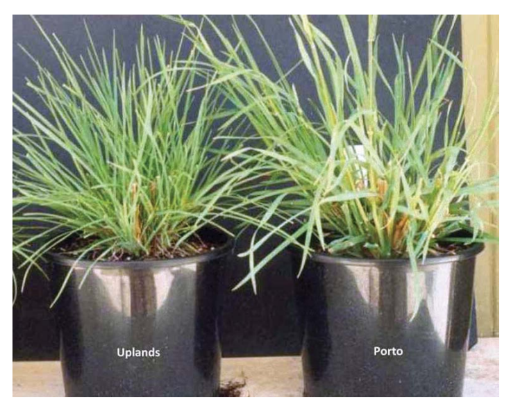
Figure 1: Comparison in plant morphology between Uplands(1) Hispanic cocksfoot and Porto cocksfoot.