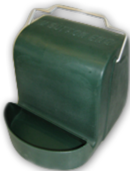
19ltr Durable Dog Drinker