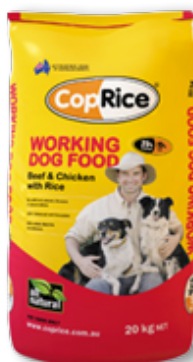
Coprice Working Dog Biscuits / 20kg