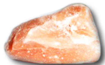
Bulk Rock Salt